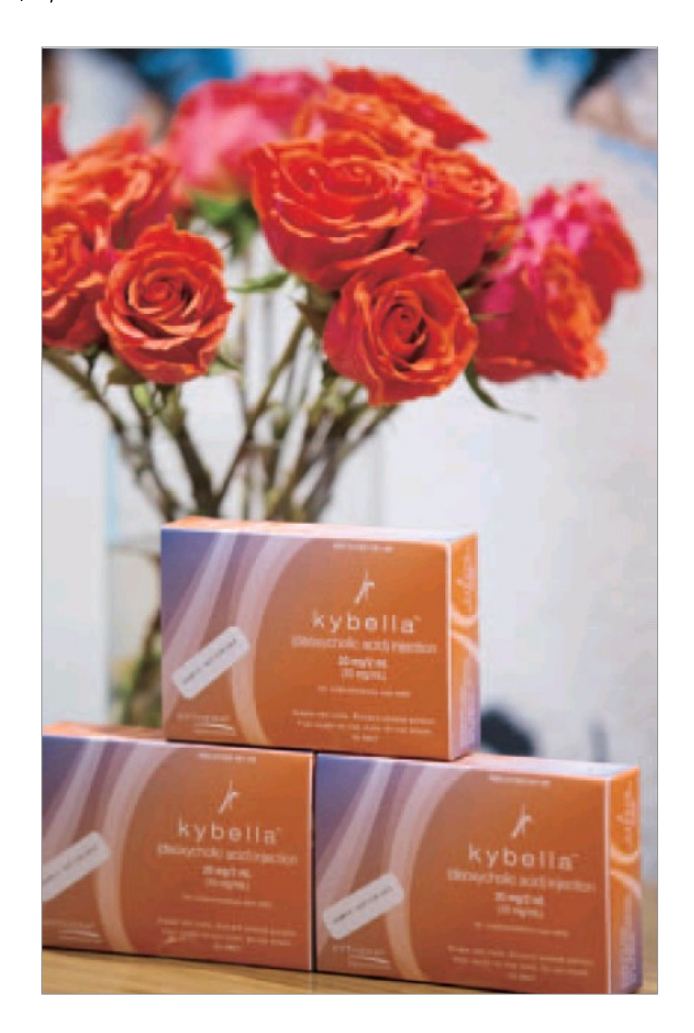
José Raúl Montes, MD, FACS, FACCS

The cost of treatment can range from $ 1,200 to $3,000.