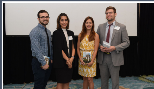
Poster presentation during Convention 2018 made possible with a generous donation from Jan Kramer, MD '73.